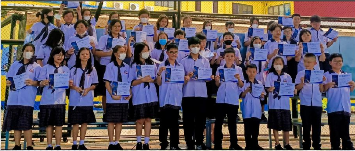
Fruit of their labor. The winners of the Readers Theater competition proudly flexed their certificates during the closing program.